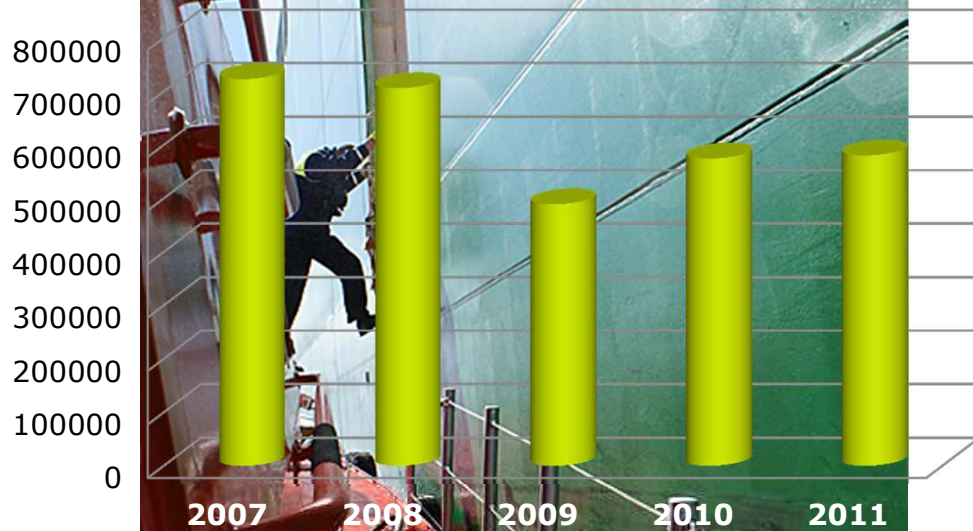
Record of pilotages 2007-2011